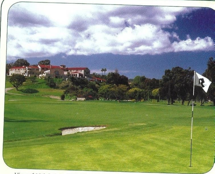
View of 10th hole and Clubhouse