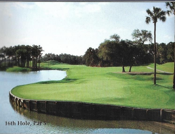
16th Hole, Par 5